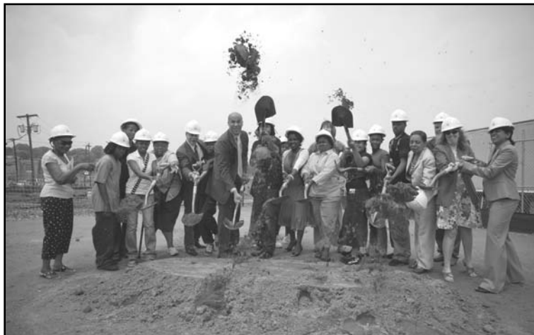
Newark Mayor Cory Booker and project team brok ground on Nat Turner Park in the Central Ward on June 16

Located in the Central Ward's Springfield neighborhood, Nat Turner Park is adjacent to Hayes Park West Pool and Recreation Center and surrounded by multifamily residential housing as well as several schools, including Eighteenth Avenue School, Cleveland School, and